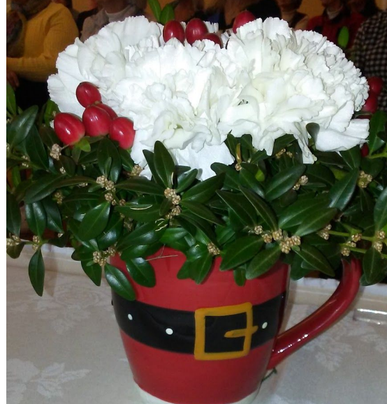
Christmas mug with white carnations -Amanda Kent from "Endless Creations" Nov. meeting demo.