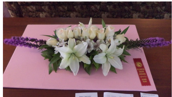
Joyce Haring's floral design for the House and Garden Tour & The Added Touch Flower Show

If you have the Pin Cushion Mum growing, now is the time to "pinch back" the terminal bud for more blooms, and pinch it again around July 4th. The blooms will occur after they receive 12.5 hours of darkness regularly.